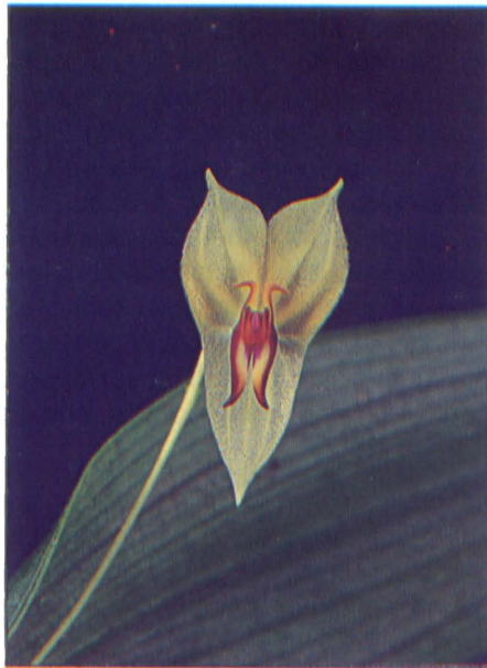
124. LEPANTHES NICOLASII Luer & R. Escobar

This species is known only from a collection in the Central Cordillera of Colombia and cultivated at Colomborquídeas. The congested raceme is pendent, borne by a slender, elongated, arching peduncle from beneath the leaf. The large flowers are held out on elongated ovaries. The sepals are microscopically pubescent; the petals are transverse with the upper lobe narrowly triangular and the lower uncinately; the lobes of the lip are narrowly ovate with the lamina developed only below the middle with the distal halves merely narrowly triangular. The appendix is minute and bilobulate.